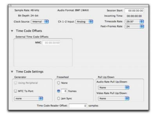
Session Setup window with DV Toolkit Option

The Time Code Rate for the session can be set in the Session Setup window with the Timecode Rate selector. The Time Code ruler displays the Time Scale in SMPTE frames (hours:minutes:seconds:frames).