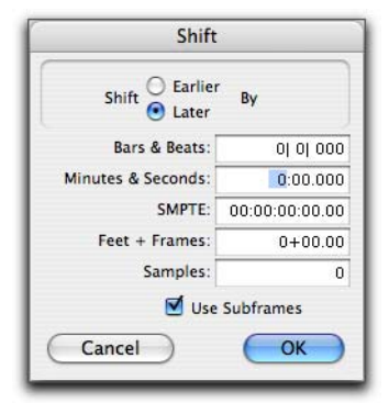
Shift dialog with the Use Subframes option enabled

When spotting or shifting material in Pro Tools, or using the Go To dialog, enable the Use Subframes option for greater precision.